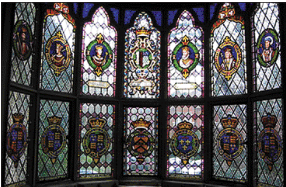
Stars of the house: many of the glass windows came out of 16th century Flemish houses

'At every step in Strawberry Hill there is evidence of the owner's delight in devising curiosities'