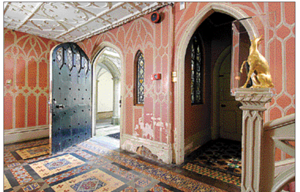
Faded grandeur: damage in the entrance hall gives an idea of the repairs needed throughout the house

tent, and a stairwell ceiling with stained-glass quatrefoils on a midnight-blue background, adorned with gold stars.