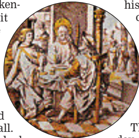
Drama: the stained-glass windows added to Walpole's theatrical setting

S TRAWBERRY Hill in Twickenham is as delicious as it sounds. The villa on the Thames was created by Horace Walpole MP, essayist, letter writer, and assiduous dilettante. Originally built by the coachman of the Earl of Bradford, the Georgian house began life as a strictly vanilla-flavoured dwelling called Chopp'd Straw Hall. Between 1747 and 1792, however, Walpole renamed it more poetically, doubled its size and turned it into a little Gothic castle, complete with crenellated towers and finials, windows with ogee arches and a stairwell based on a flight of stairs at Rouen Cathedral.