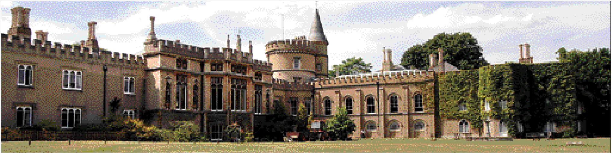
Gothic gorgeousness: over a 45-year period, Horace Walpole doubled the size of Strawberry Hill and turned it into a mini, turreted castle. Today, £8.8 million is needed to bring its rotting interior back to former glory